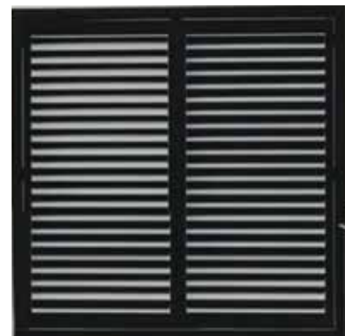
uPVC Fixed Louvers

White, Noir Grey, Champagne Gold, Golden Desert, Graphite Grey, Silver Grey, Graphite Black, Walnut, Urban Grey, Phantom Grey, Vintage Brown and Mocha Brown