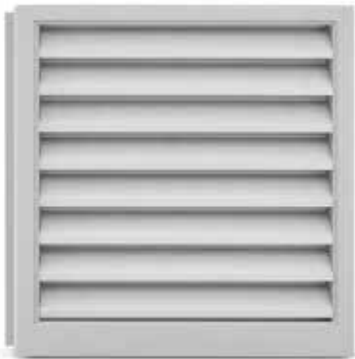
Aluminium Fixed Louvers